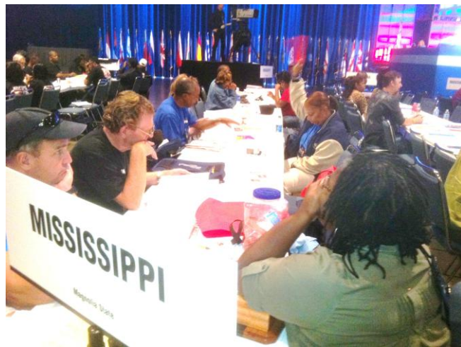
Your delegates working hard at the Convention in Los Angeles.

The United States Postal Service delivers more mail to more addresses in a larger geographical area than any other post in the world. The Postal Service delivers to more than 151 million homes, businesses and Post Office boxes in every state, city, town and borough in this country. Everyone living in the U.S. and its territories has access to postal products and services and pays the same postage regardless of their location.