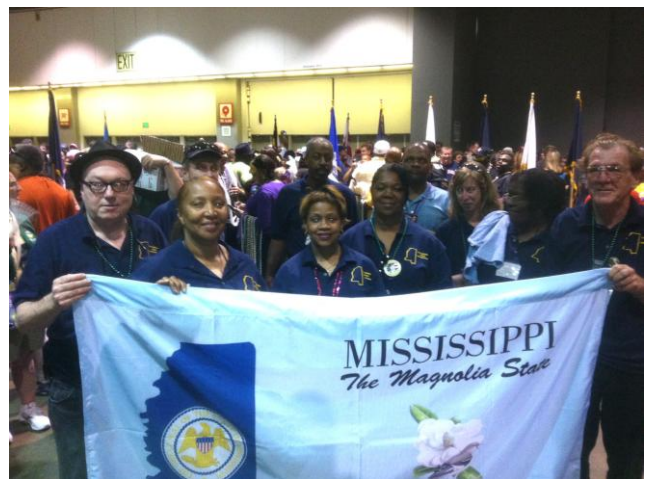
The crew at the Parade of States at the National Convention in Los Angeles